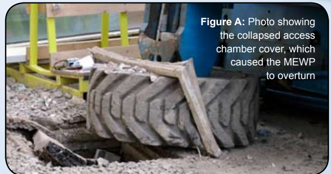
Figure A: Photo showing the collapsed access chamber cover, which caused the MEWP to overturn

A serious incident recently occurred on a construction site that involved a 'cherry picker' type of Mobile Elevating Work Platform (MEWP). In this instance, the MEWP overturned whilst its operator was within its 'basket'. The cause of the accident related specifically to the machine's centre of gravity and stability, which suddenly altered dramatically when an access chamber cover gave way beneath one wheel of the vehicle (see Figure A). Regrettably, the MEWP operative was working at a height of approximately 14m when the vehicle overturned and consequently, sustained serious injury as a result of the accident.